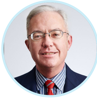
Jim Duggan, PE Commissioner