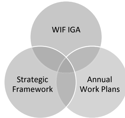
Figure 1. Context for Evaluating WIF Commission Managing Agency Performance

In 2021, the Board adopted a Strategic Framework: Mission, Vision, Values & Goals (Strategic Framework), which is intended to serve as the WIF Commission’s core framework for annual planning and effective decision making (summarized in Appendix B). Each year, the Board adopts an (AWP, pursuant Section 4.7.4 of the IGA, in association with an annual budget. The AWP defines the objectives, scope of work, and budget for the MA to fulfill its duties under the IGA and advance the Mission, Vision, Values and Goals established in the Strategic Framework.