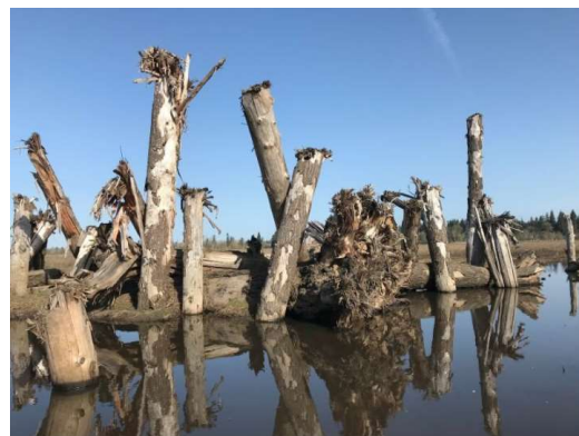
Trees removed from PLM_5.2 were donated to CWS for use in Chicken Creek restoration at Tualatin River National Wildlife Refuge. The Tree Donation Acknowledgment Form simplifies the process for future donations.