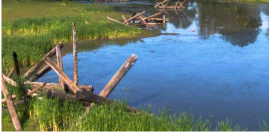
Hillsboro Parks & Recreation Department is interested in receiving trees from PLW_2.1 for re-use in environmental projects at Jackson Bottom Wetlands

Consider authorizing the General Manager to approve requests for tree donations to outside parties, including other governmental entities, which execute a Tree Donation Acknowledgement Form.