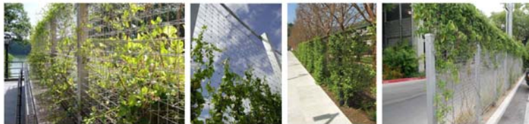
green screen precedents

RIDGEWOOD VIEW AND RESERVOIR PARKS WATER FACILITIES REPLACEMENT PROJECT