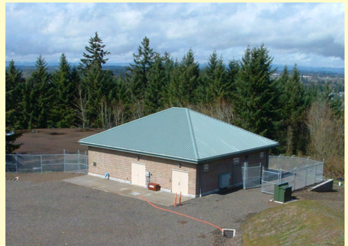
TVWD's Grabhorn ASR

For more information about ASR, visit asrforum.com